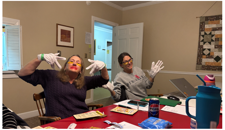
WSMOTC Pampers themselves with Eye, lip and hand masks