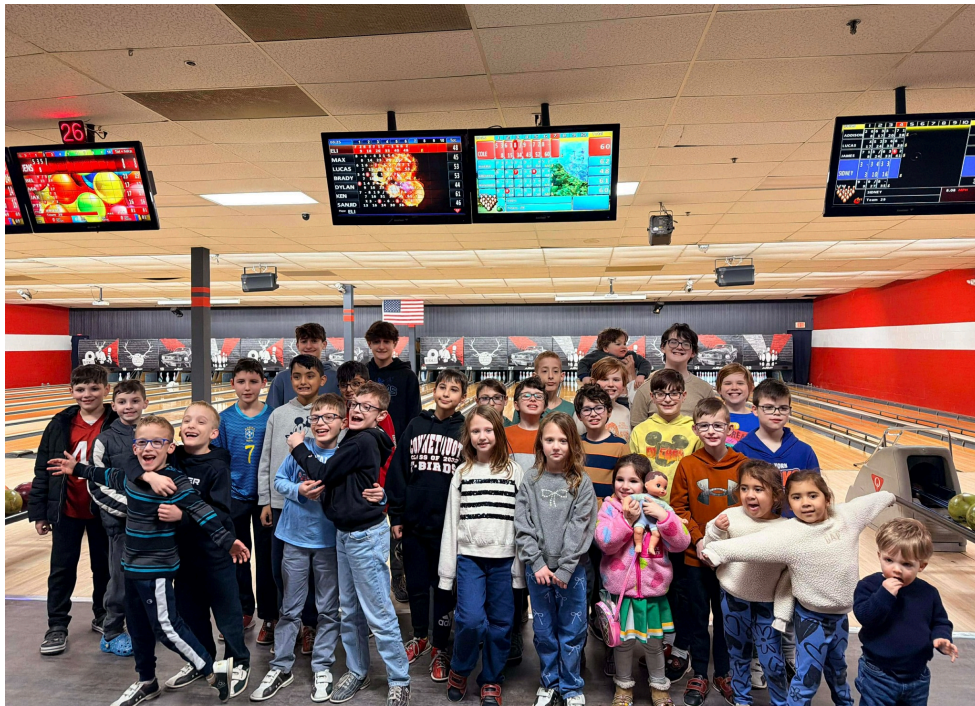
MOTC Children's Winter Social 2026