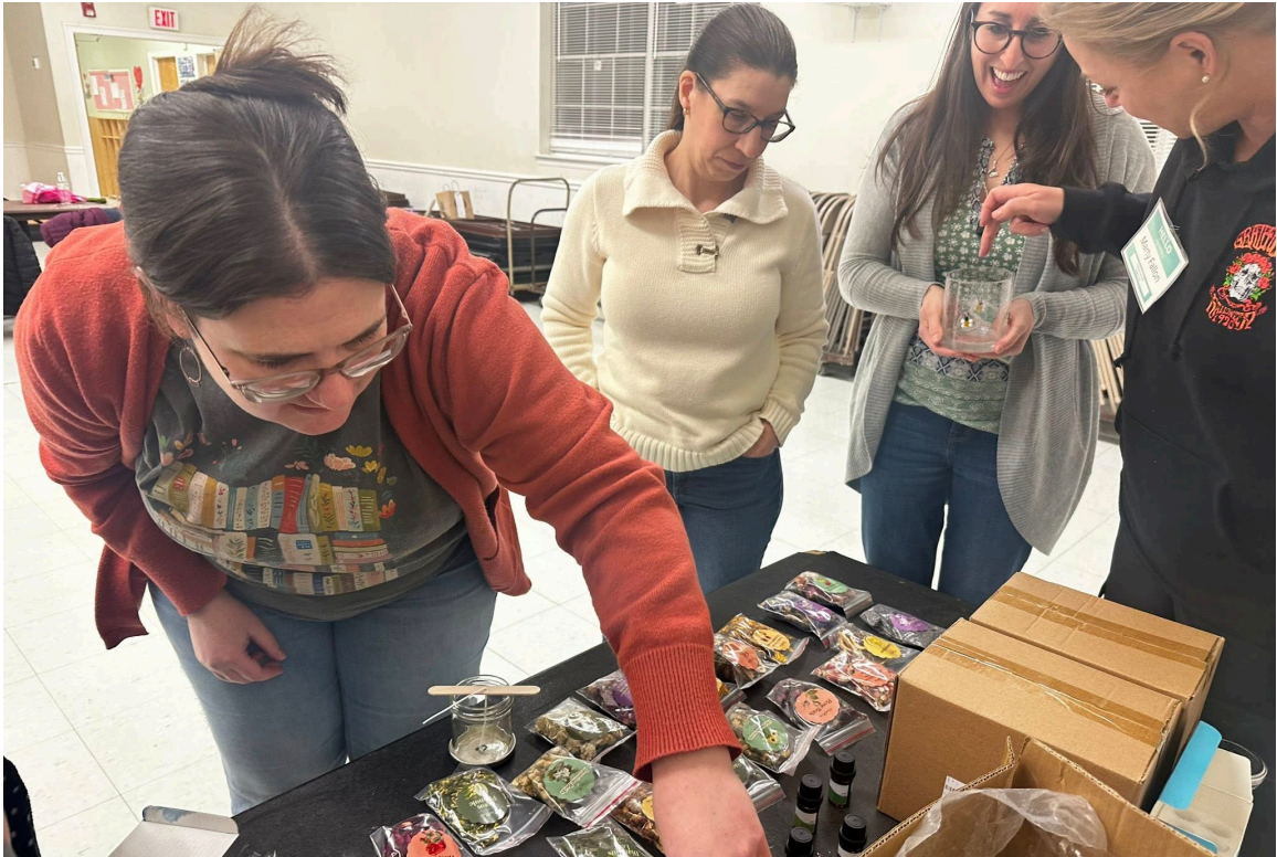
MOTC Suffolk Candle Making