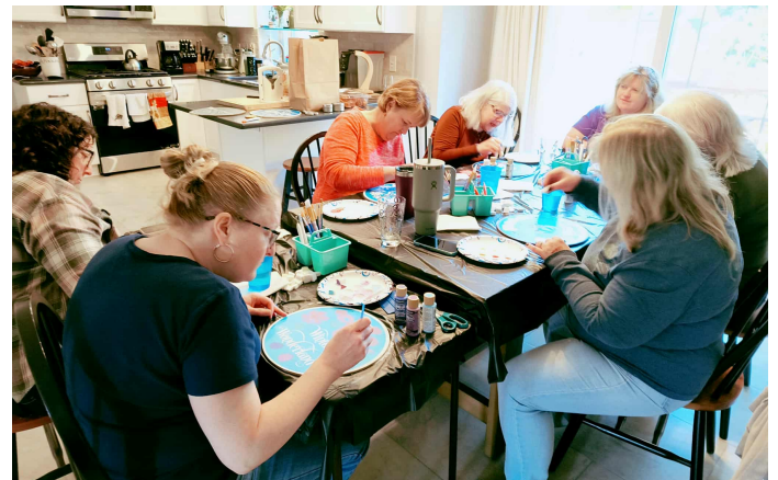
GRMOTC November Meeting