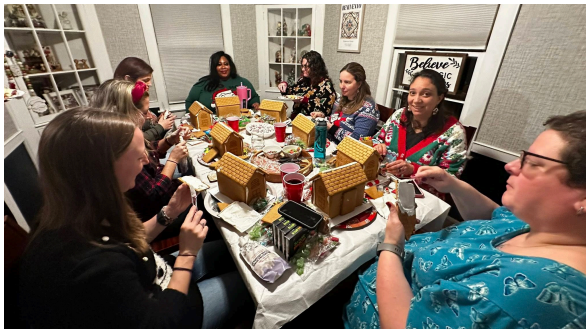
MOTC Suffolk Gingerbread making