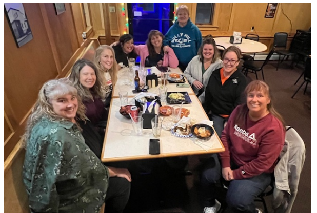
Chemung Meeting at The Elbow Room