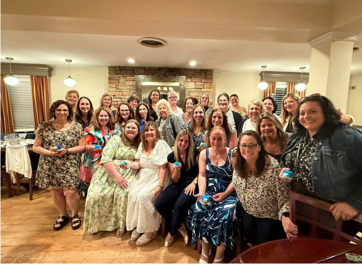
The members of MOTC Suffolk gathered for their installation dinner on June 10th at the Parlor House Grill in Sayville.