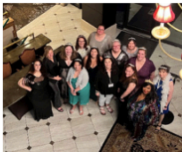
MOTC Suffolk, Saturday night at convention.