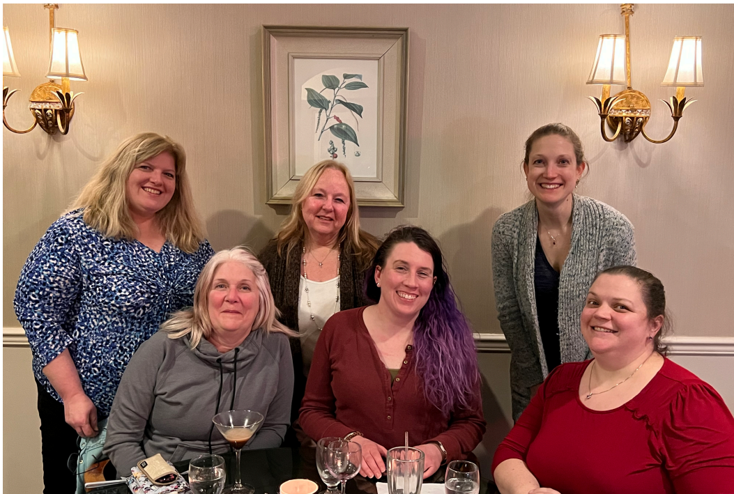
Greater Rochester MOTC

These are pictures and reports submitted from member clubs.