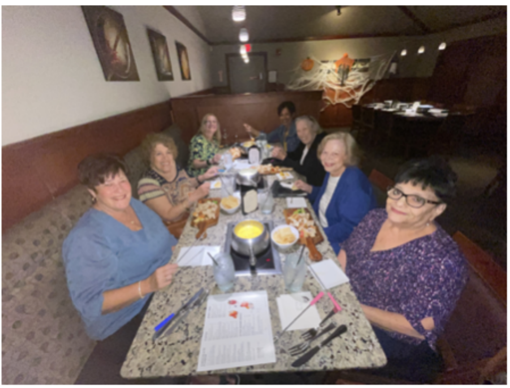
Former and current members reunited...