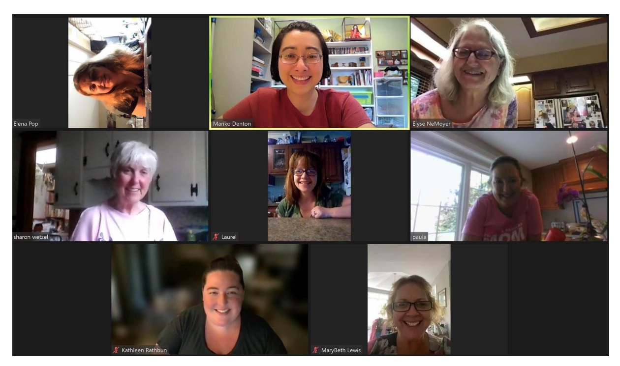
MOTC Suffolk Summer Activities

On, Sunday, July 18, a group of MOTC Suffolk ladies, family and friends went on a Brew Cycle Tour of several breweries in Riverhead. It was one of those group cycles with people on either side and someone steering up front. A good time was had by all.