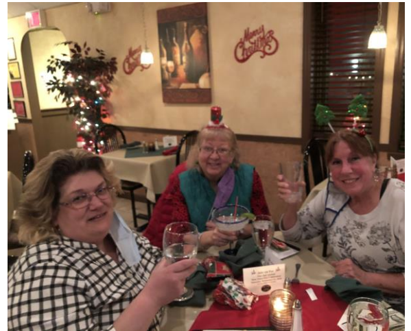
Schenectady's Christmas Dinner