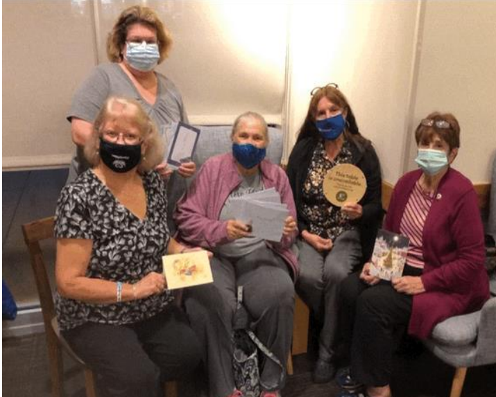
November meeting of Schenectady sends Christmas cards to Veterans